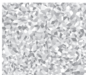
Galvalume TSR 25%